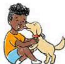
Relax with Pets