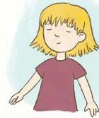
Take 5 deep breaths of fresh air