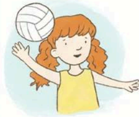
Play your favorite game just for fun