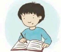
Write in a journal