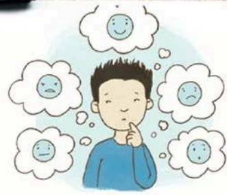
Ask yourself how you're feeling right now