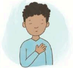
Put your hand on your heart and feel it