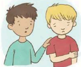
Pay attention to someone next to you