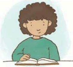
Get lost in a book