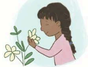
Pause and notice the world around you