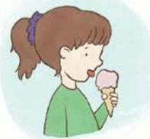
Taste, smell, touch the food you're eating